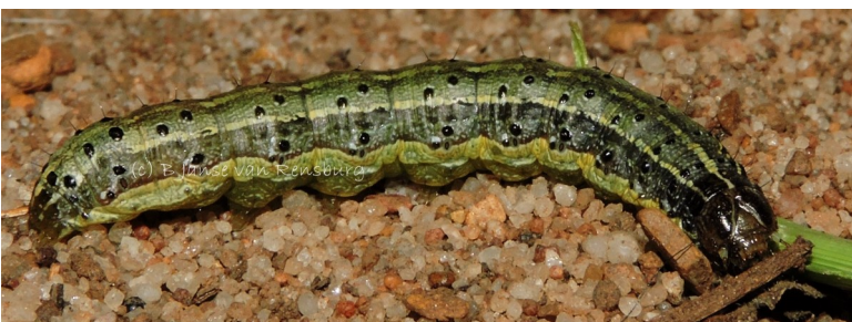
Isibungu se-FAW (Isigaba sokukhula sesi-5)

Ubude beempiko buhluka ukusuka ema- 30 ukuya kuma- 40mm. Iimpiko zangaphambili: iduna - umbala otshetlha ukuya kozotho, namacaphazi webala elimhlophe emphethweni wangaphandle; isikazi – itshetlha ukuya kuzotho, imimerego efipheleko yeempiko. Iimpiko zangemva: iduna nesikazi zineensiba ezimhlophe/ezisiliva ezinomphetho omatsikani ozotho ongeneleleko.