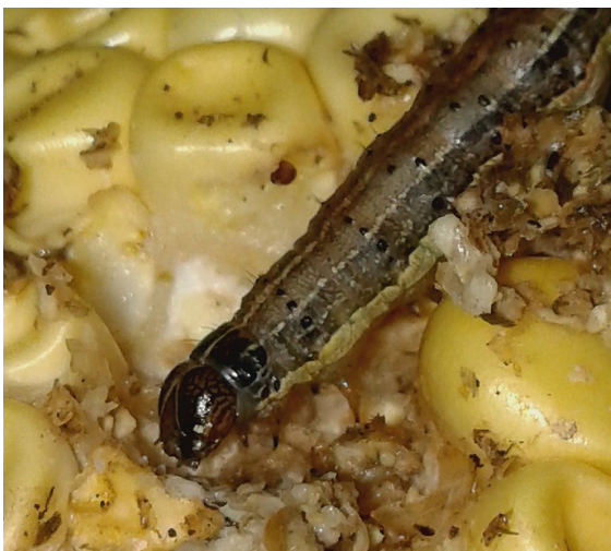
Umonakalo owenziwa yi-FAW ehlokweni yesiphila esisudu

Ukusetjenziswa lokho kufanele kwenziwe esibungwini esincani esisesesigabeni sokukhula esingaphasi kwamamilimitha ali- 10 ubude. Ukusetjenziswa ngesibungu esidadlana akusebenzi njengobana zidla ngaphakathi kwesiyingi samakari begodu ngalokho zivikelele ekuthintaneni nesibulali-khunkhwana.