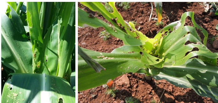
Umonakalo owenziwa yi-FAW emakarini wesiphila