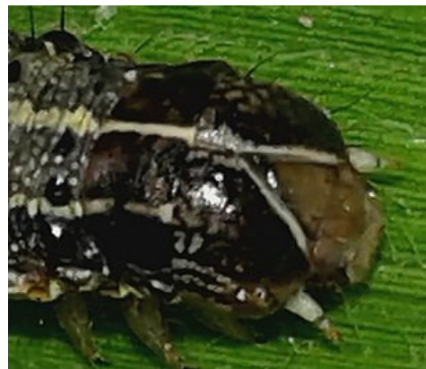
Ihloko ye-FAW ibonisa ubumhlophe obugubuzekileko baka- "Y"