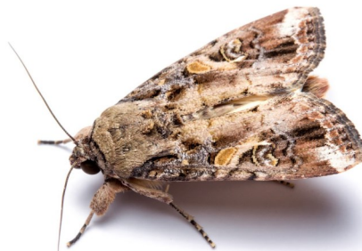
Iviyaviyani eliduna elidala le-FAW