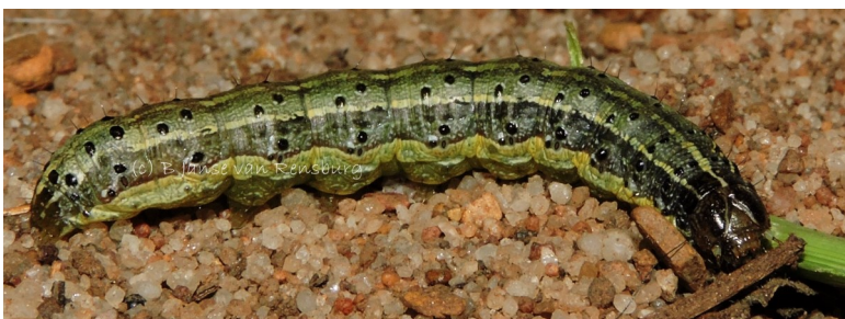
Sibungu seFAW (i-insta yesihlanu)

Budze bemaphiko kusuka kuma-30mm kuye ku-40mm. Timphiko tangaphambili: lelidvuna - umbala lomphunga kuye kulonsundvu, lobunemabalana lamhlophe emphetfweni; lelisikati - umbala lofanako lomphunga kuya kulonsundvu, kuphawuleka kwetimphiko akukacaci kahle. Timphiko tangemuva: omabili lamadvuna nalamasikati anetimphiko letimhlophe/letisiliva nemnye le lonsundvu lomnyama longumcingo.