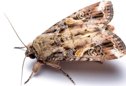
Luvivane loludvuna loludzana lweMnswenya