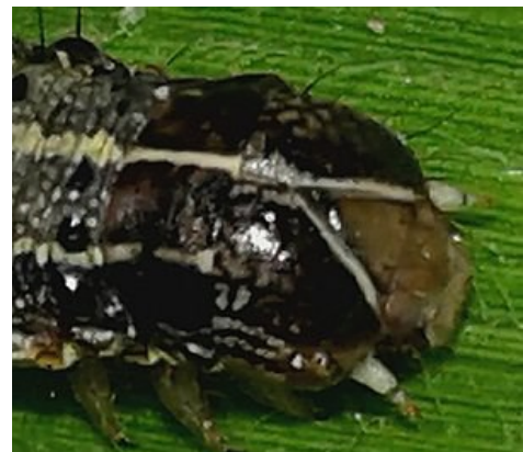
Inhloko yeFAW lekhombisa "Y" lomhlophe lobheke phasi