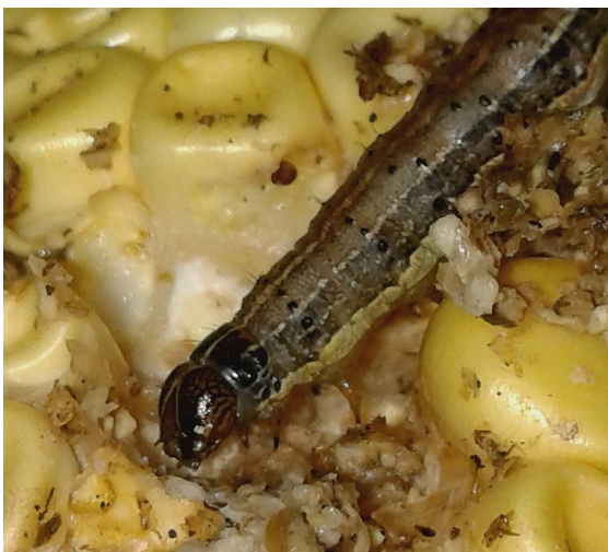
Umnswenya ulimata indlebe yemmbilashukela

Khumbula kutsi balimi kumele basebentise kuphela tibulalatinambutane letemukelwe ngemazinga ekusetjentiswa lanconotwe kulebuli yemkhicito. Kusetjentiswa kumele kwentiwe kuphela ebungini seinsta lesincane lesingaphasi kwa 10mm ngebudze. Kusetjentiswa etibungwini letindzala akuphumeleli ngoba tidla ngaphakatsi kweticu tetitjalo futsi ngako-ke tivikelekile ekuhlanganeni netibulalatinambutane.