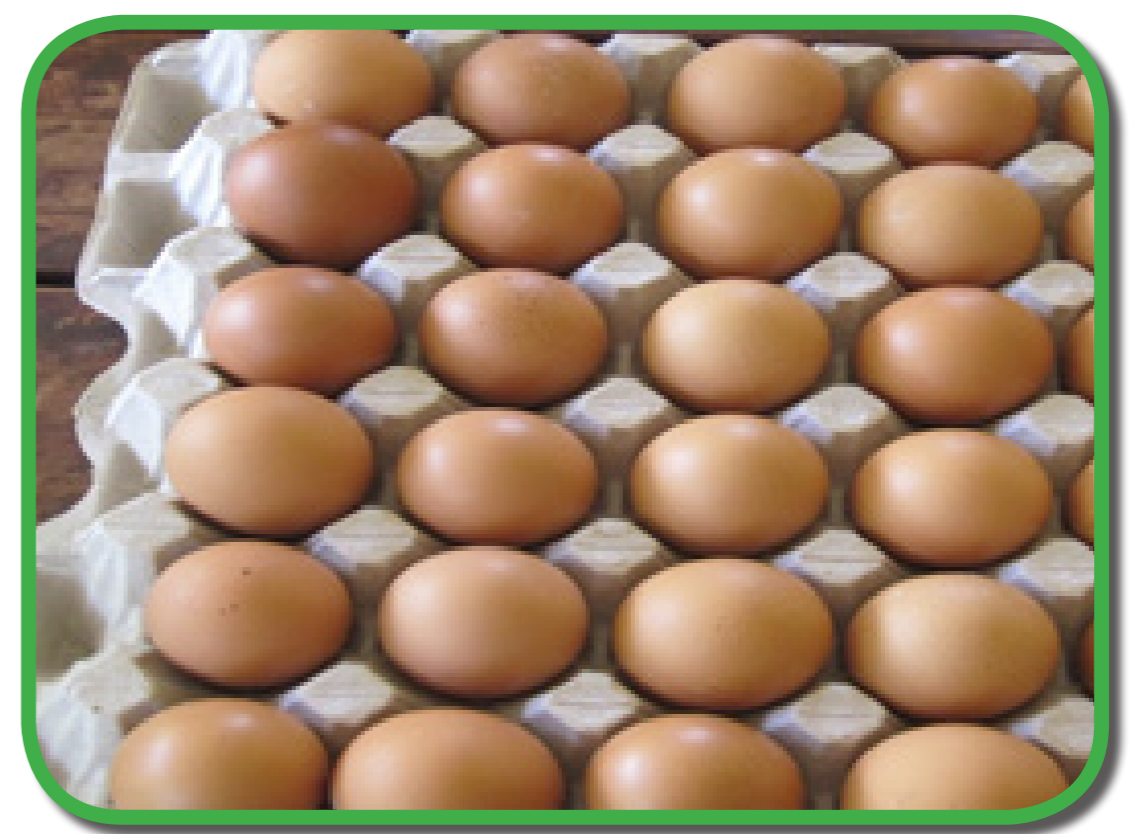
Eggs free from foreign materials