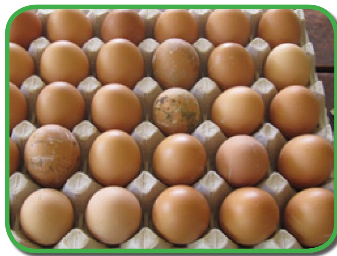
Eggs have foreign matters