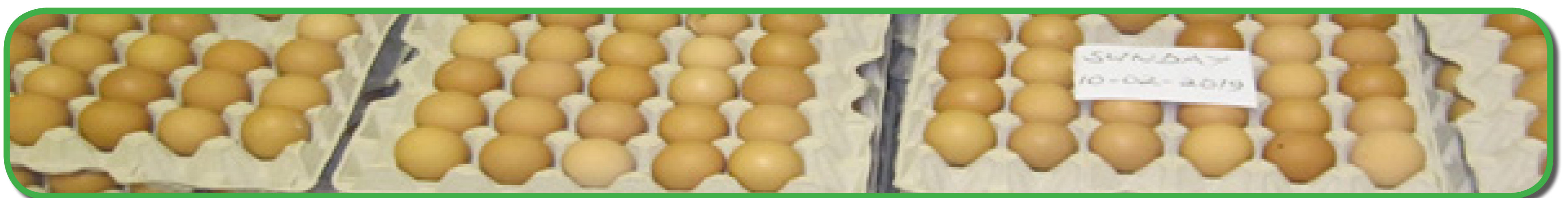
Eggs packed in such container with broads ends not facing downwards