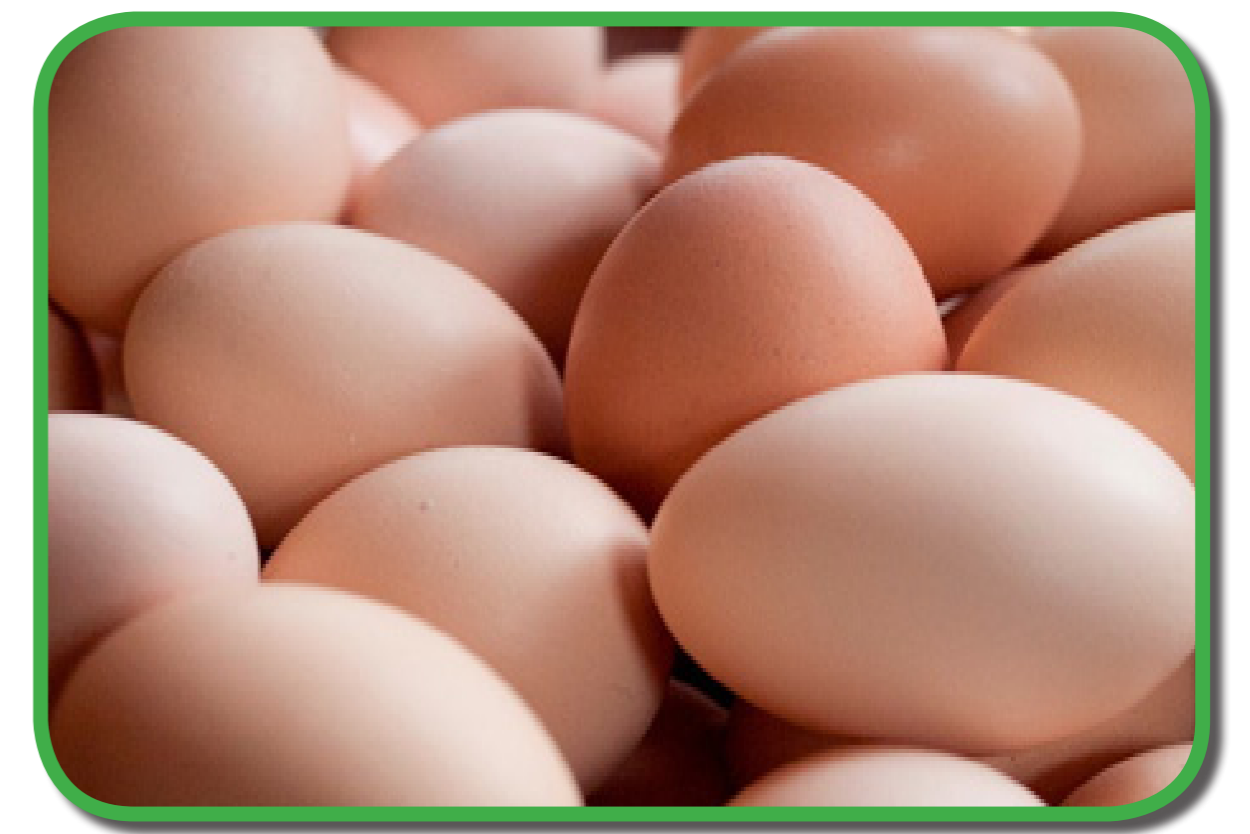
Eggs comply with prescribed standards e.g. size and grade