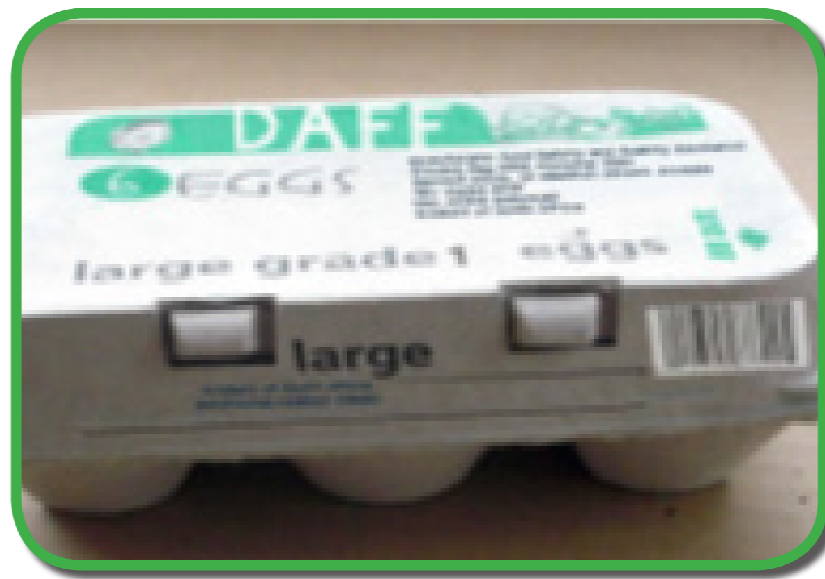
Eggs properly marked