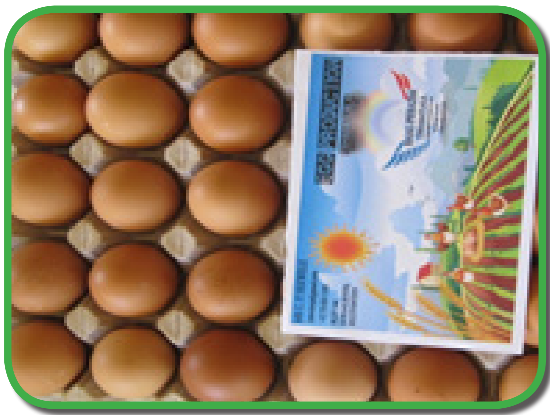
Eggs not properly marked no number of eggs, grade and size

Eggs are among the most nutritious foods on the world and according to human studies eggs contain trace nutrients that are important for health. As a result of high cost of meat consumers are constantly looking for cheaper source of protein. South Africa has requirements in place for control over the sale of eggs destined for sale on the local markets, by protecting the consumers and industry by assuring eggs are regulated under the Agricultural Product Standards Act, Act No 119 of 1990 for fair competition.